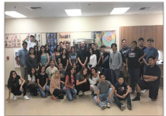
Theology of the Body